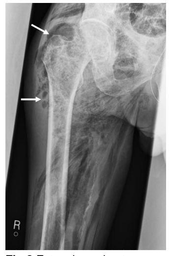
Fig 2 Extensive subcutaneous gas in the thigh of a man with necrotising fasciitis of the buttock (arrows)